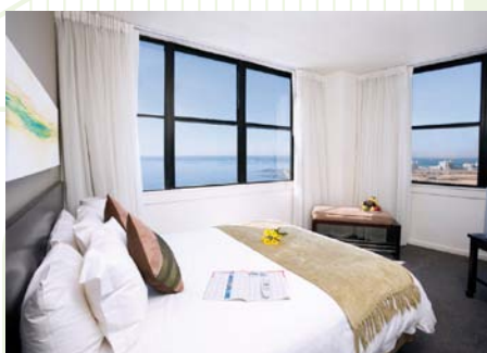
A double bedroom

Banks, pharmacy, restaurants, bars, night clubs, supermarkets, golf course, waterfront, mini-golf, gym, places of worship, stadium, beaches, petrol station, and mountain hikes (Including Table Mountain).