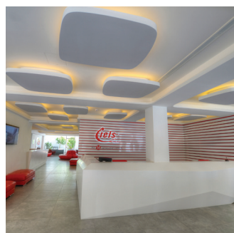
IELS Malta Reception