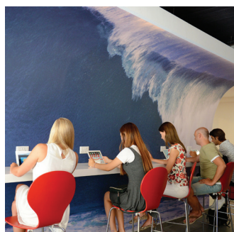
Students surfing the Internet

IELS Malta Institute of English Language Studies, Matthew Pulis St, Sliema SLM 3052, Malta