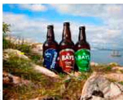
Top: Brunel's suspension bridge at Bristol. Above left: Bays Beer. Above right: Birmingham.