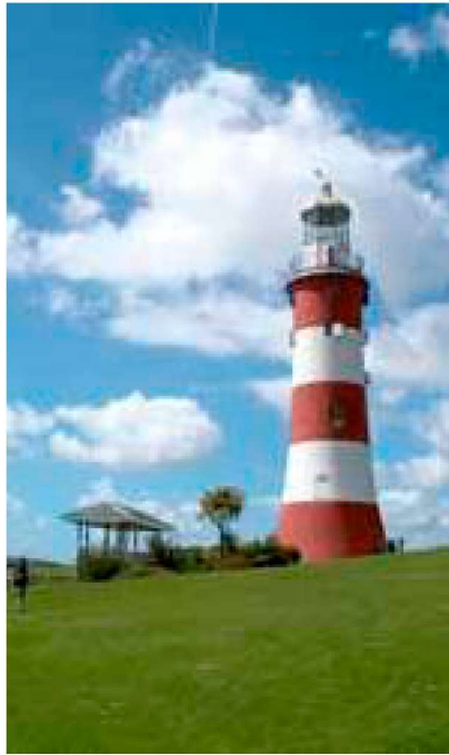
Above: Smeaton's Tower - the old Eddystone Lighthouse - at Plymouth. Right: Stonehenge.