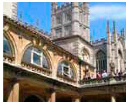
Above: Dartmouth. Top right: Bath. Below: Battlefield live.

The following pages contain a useful guide to the places we visit regularly on our excursions programmes.