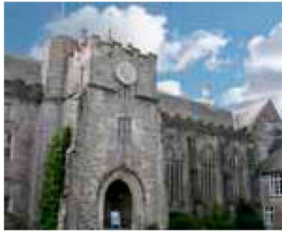
Top: Dartington Hall. Bottom: ferry to Dartmouth.