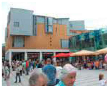
From the top: the Eden Project; ancient and modern in Exeter.

British seaside town of Seaton, with its beach, shops and miniature Tramway.