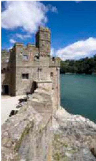
Left: Dartmouth Castle Below: coast near Torbay. Bottom: Cockington village.