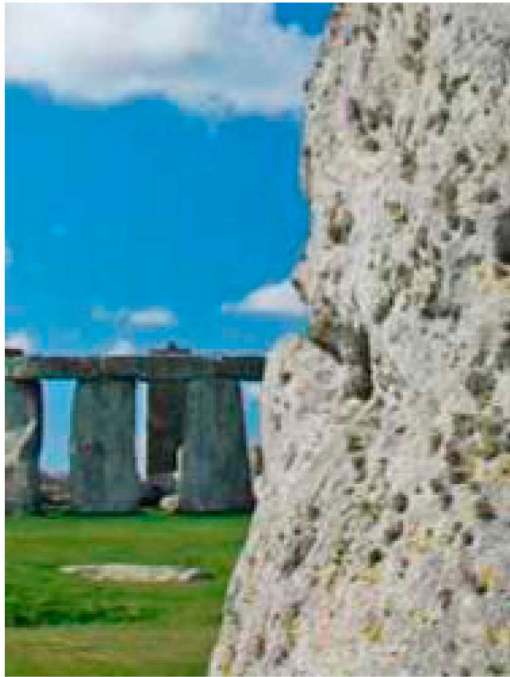
Top: Salisbury. Middle: South Hams. Bottom: Slapton.