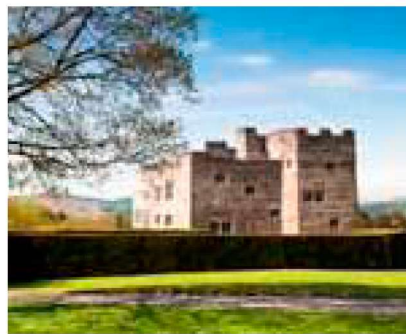
Top: Cardiff. Above: part of Castle Drogo.