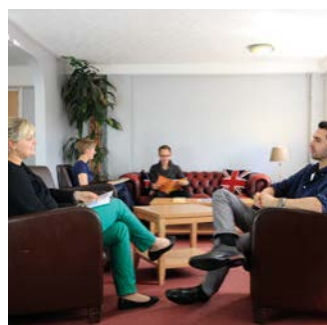
Relax in the Adult Lounge