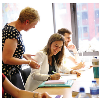
A typical classroom

LAL London | Allied House, 29-39 London Rd, Twickenham, TW1 3SZ