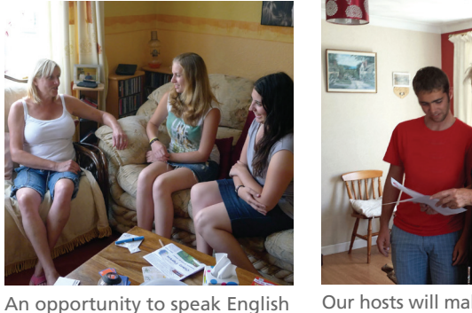
Our hosts will make you welcome

Local facilities depend on location of Host Home.