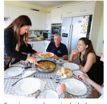
Evening meals are included

Regular buses cover all Torbay. A weekly ticket costs about £19.