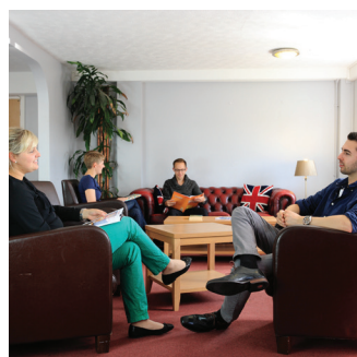
Relax in the Adult Lounge