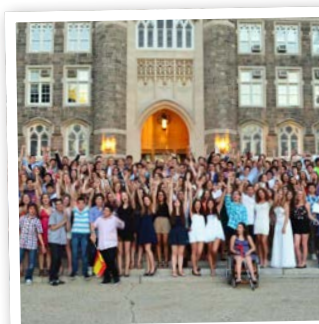
LAL New York students